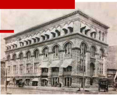
Denver Chamber of Commerce building in 1884 at 14th and Lawrence streets.