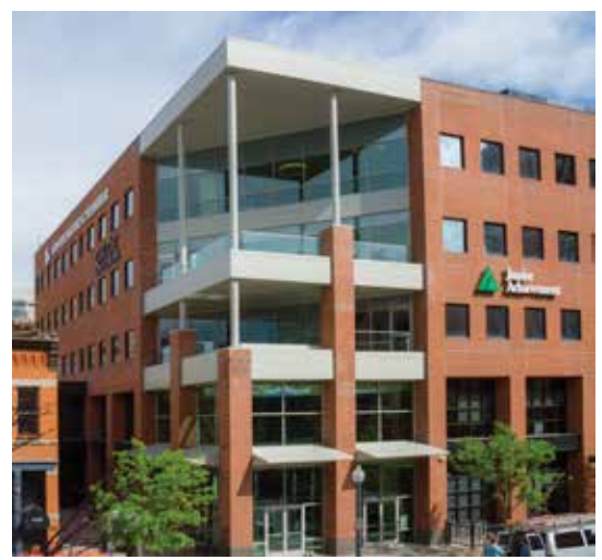
Denver Metro Chamber of Commerce building, remodeled in 2014, at 1445 Market St.